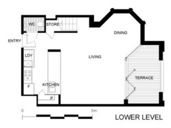
APARTMENT No. 4 SECOND FLOOR