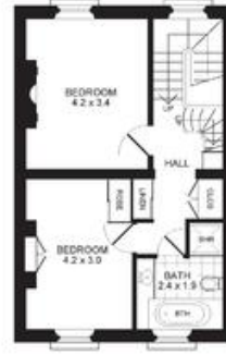
SECOND FLOOR Scale 1cm = 1m (approx)