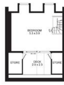
THIRD FLOOR Scale 1cm = 1m (approx)