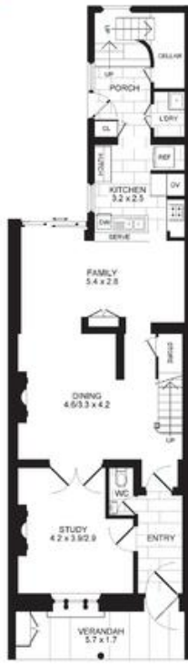
GROUND FLOOR Scale 1cm = 1m (approx)