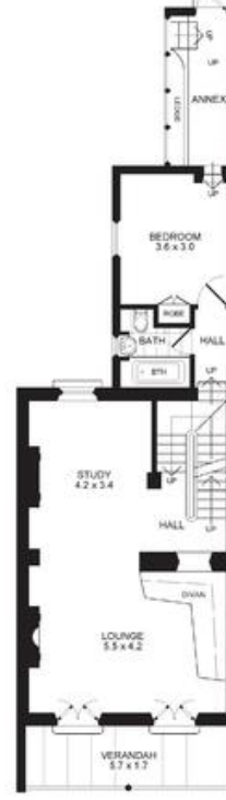
FIRST FLOOR Scale 1cm = 1m (approx)