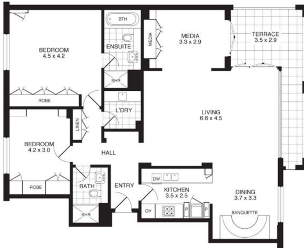
FLOOR PLAN Scale 1cm = 1m (approx)