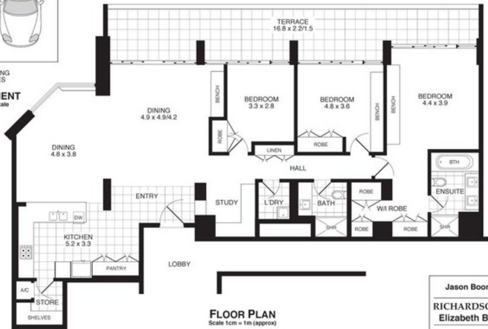
FLOOR PLAN Scale 1cm = 1m (approx)