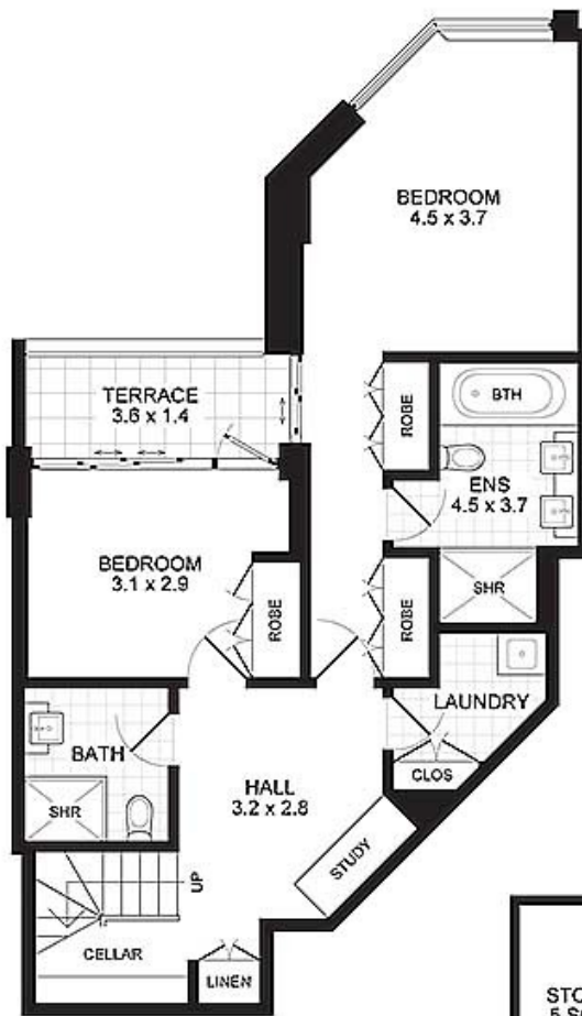
LEVEL ONE Scale 1cm = 1m (approx)