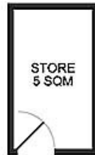
STOREROOM Not to Scale

COPYRIGHT © 2012 PROMOPLANS 02 9572 7111 Warning: Usage restricted under the Copyright Act