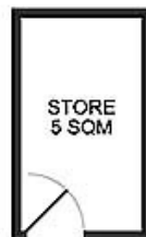
STOREROOM Not to Scale

COPYRIGHT © 2012 PROMOPLANS 02 9572 7111 Warning: Usage restricted under the Copyright Act