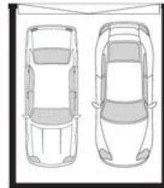
LU GARAGE 5.4 x 4.5