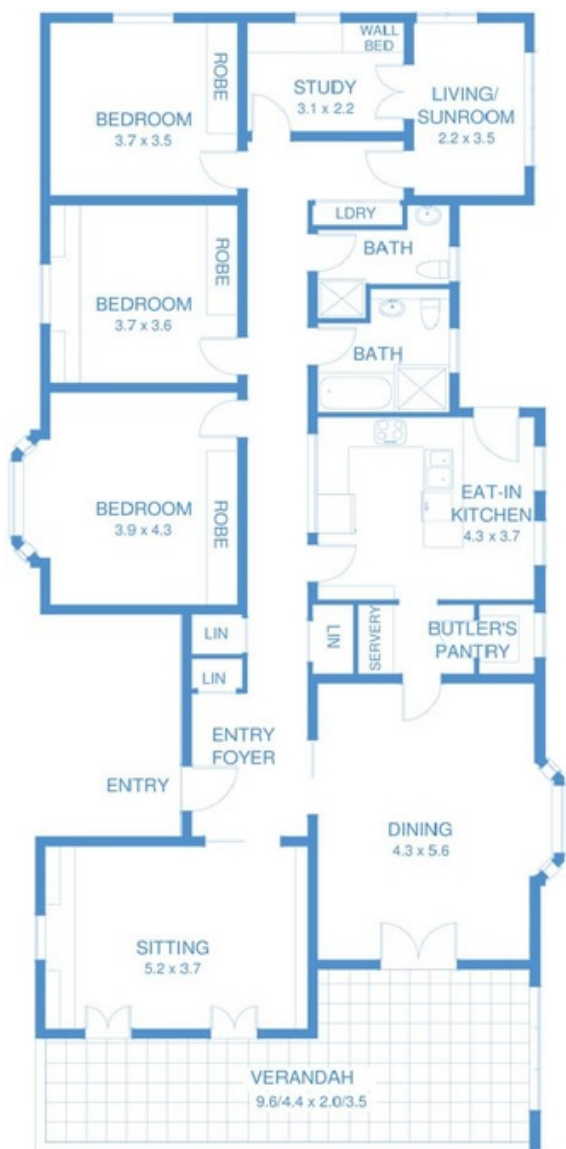
APARTMENT- 217.4 SQM APPROX