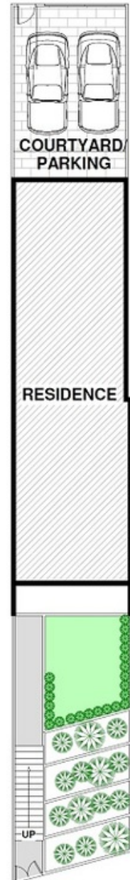
SITE PLAN (NOT TO SAME SCALE)