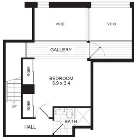
LEVEL TWO Scale 1cm = 1m (approx)