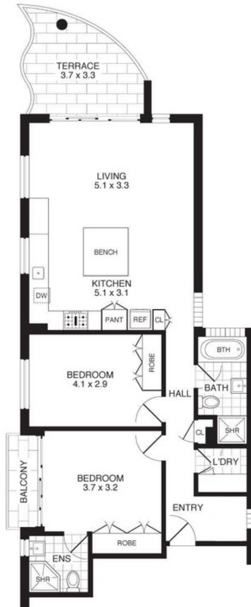
FLOOR PLAN Scale 1cm = 1m (approx)