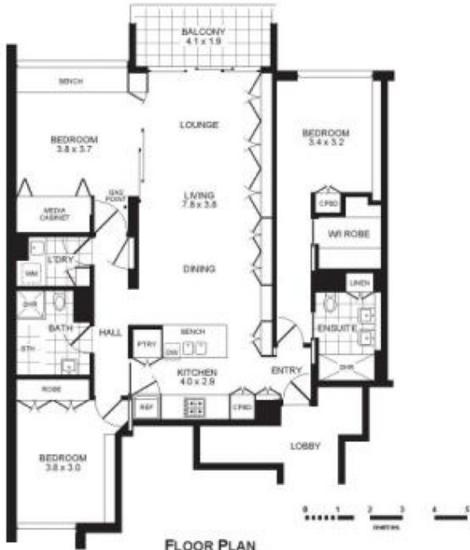
FLOOR PLAN Scale 1:100 = 1m (approx)