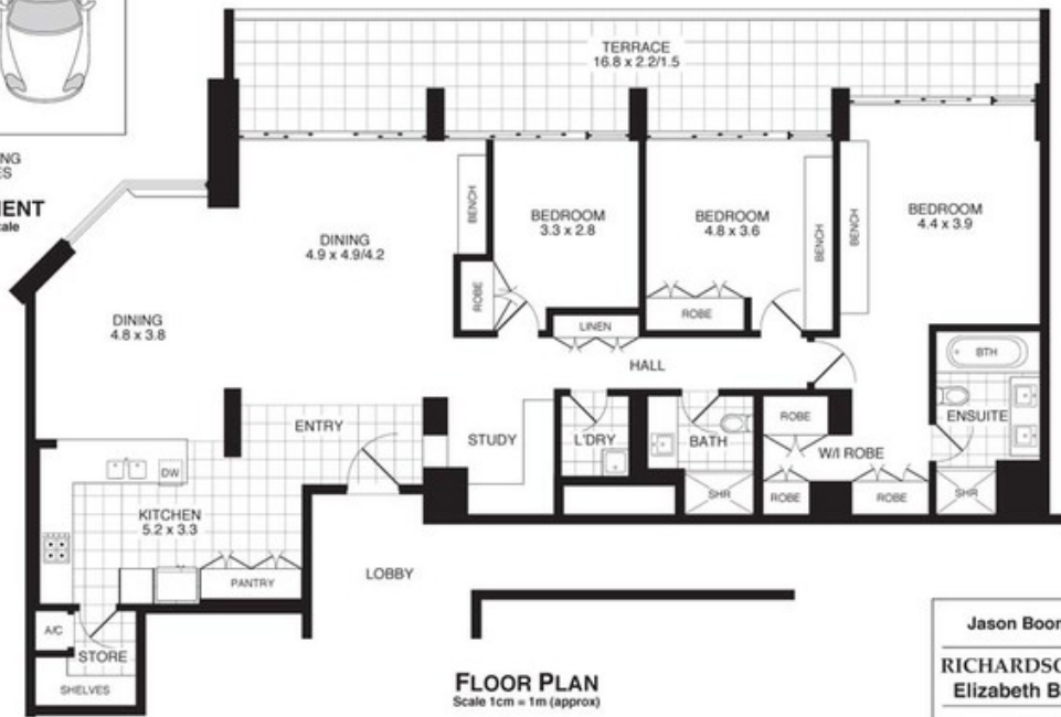
FLOOR PLAN Scale 1cm = 1m (approx)