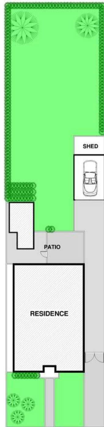
SITE PLAN (NOT TO SAME SCALE)