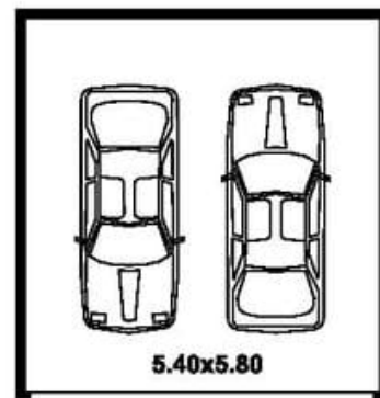
SECURITY UNDERCOVER L.U.GARAGE