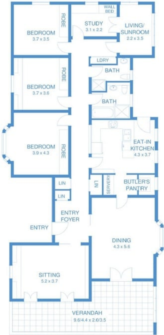
APARTMENT - 217.4 SQM APPROX