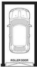
LJ GARAGE 20 SQM