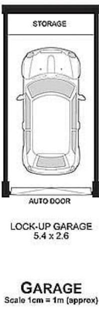
FLOOR PLAN Scale 1cm = 1m (approx)