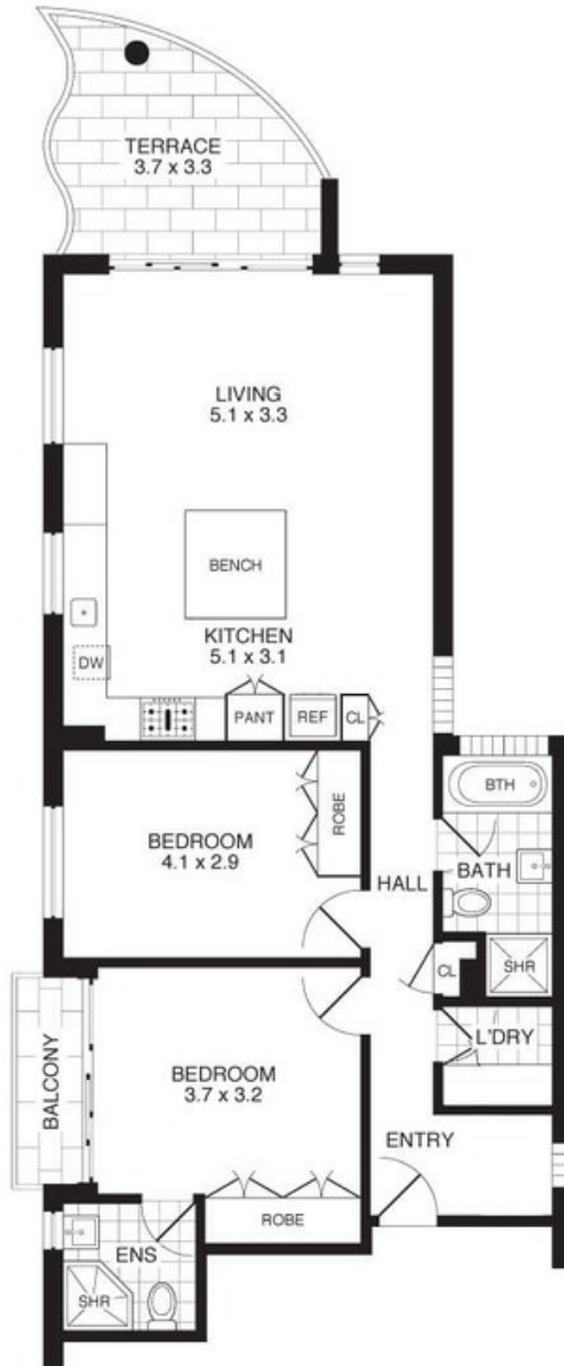
FLOOR PLAN Scale 1cm = 1m (approx)