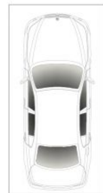
SECURITY CAR SPACE (NOT ACTUAL LOCATION)