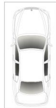
SECURITY CAR SPACE (NOT ACTUAL LOCATION)