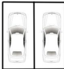
CAR SPACES (NOT ACTUAL LOCATION)