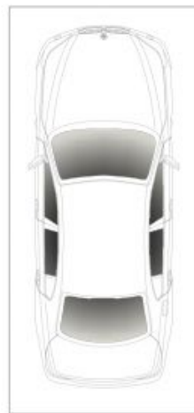
CAR SPACE (NOT ACTUAL LOCATION)