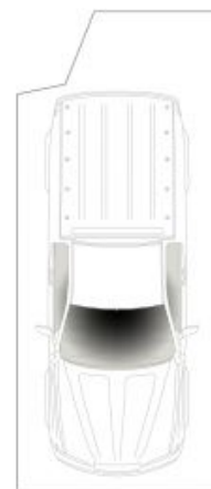
CAR SPACE 5.8m x 2.4m (NOT ACTUAL LOCATION)