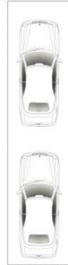
SECURE TANDEM CAR SPACE (NOT ACTUAL LOCATION)