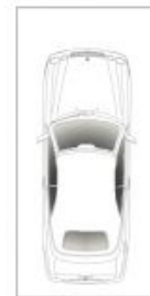
SECURE CAR SPACE (NOT ACTUAL LOCATION)