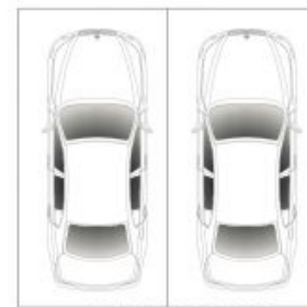
SECURE CAR SPACES (NOT ACTUAL LOCATION)