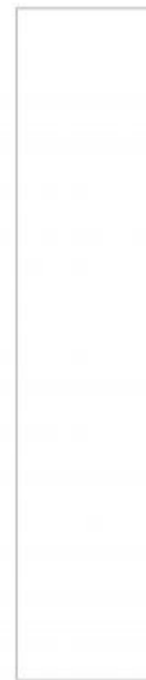
STORAGE 11.0m x 2.2m x 1.1m