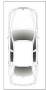
UNDERCOVER PARKING 5.4m x 2.6m